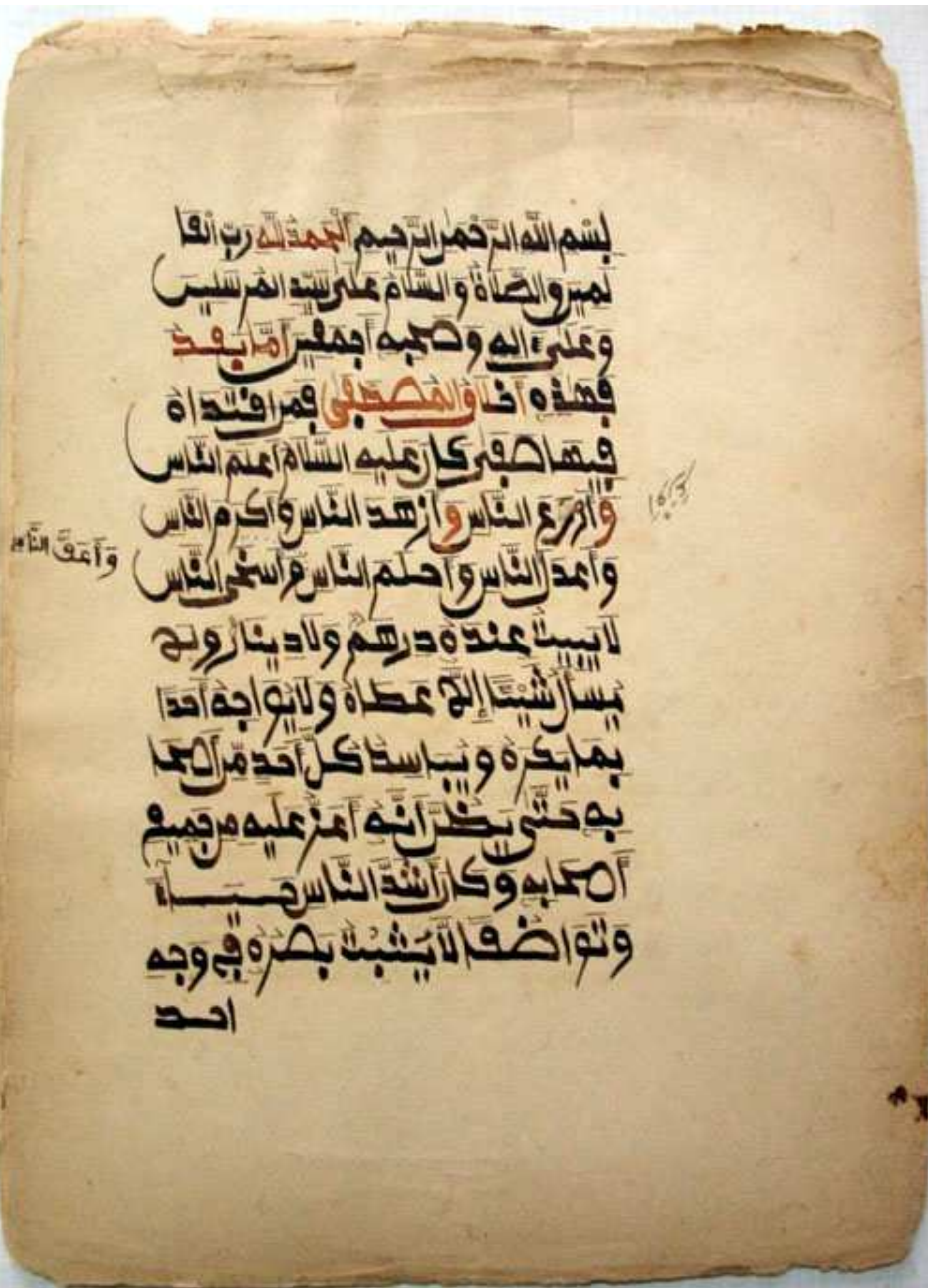
Folio 1 of the manuscript Akhlaaq al-Mustafa of Shaykh Abdullahi ibn Fuduye , digitized from the archives of the Center for Islamic Studies at the University of Shaykh Usuman Danfodio , in Sokoto, Sokoto State, Nigeria